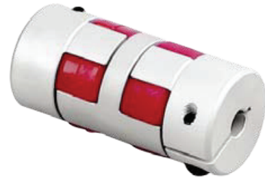
WJDM Outside diameter 20-80