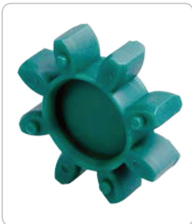
elastomer : 64/sh D temperature range:-20~+120°C