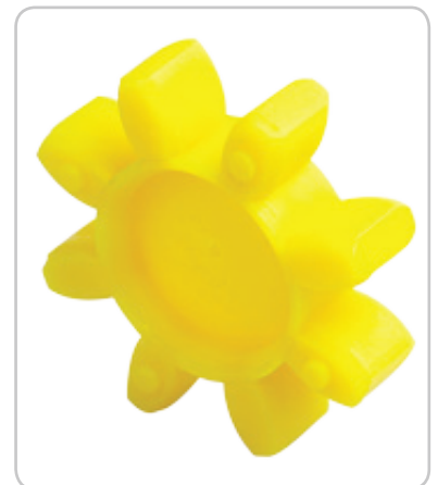
elastomer : 92/sh A temperature range:-40~+90°C