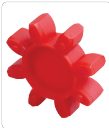
elastomer : 98/sh A temperature range:-30~+120°C