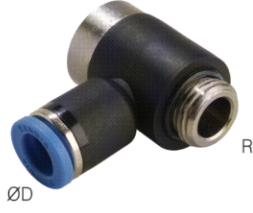
Extended Male Elbow