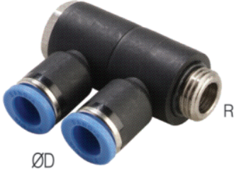
Double Universal Elbow